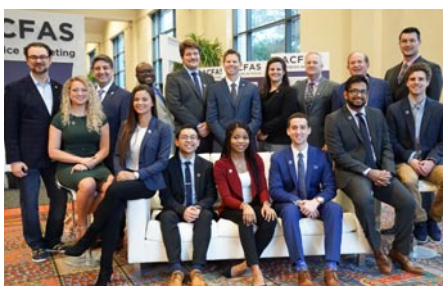
Student Scholars with representatives of the ACFAS Region Presidents Council.

Congratulations to the 2020 ACFAS Region Scholars! Each Student Scholar received a scholarship from his or her respective ACFAS Region to attend this year's Annual Scientific Conference in San Antonio. Individual scholar photos can be found on each Region's webpage .