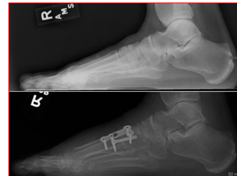
Group 1 (above): weight bearing lateral radiograph preoperatively and at 12 months post-operatively revealing maintenance of preoperative first ray sagittal plane alignment

Both the overall incidence and average degree of post-operative first metatarsal elevation was significantly lower in the curettage joint preparation group (Group 1) when compared to the planal resection study group (Group 2) at final follow-up. The overall incidence of post-operative elevation was 77.8% (7 of 9) in Group 1 versus 12.5% (1 of 8) in Group 2. Average degree of post-operative elevation was 5.4 degrees in Group 1 versus 0.87 degrees in Group 2.