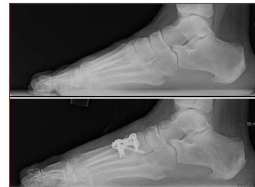
Group 2 (above): weight bearing lateral radiograph preoperatively and at 12 months post-operatively revealing significant iatrogenic first metatarsal elevation (6.99 degrees in figure shown)