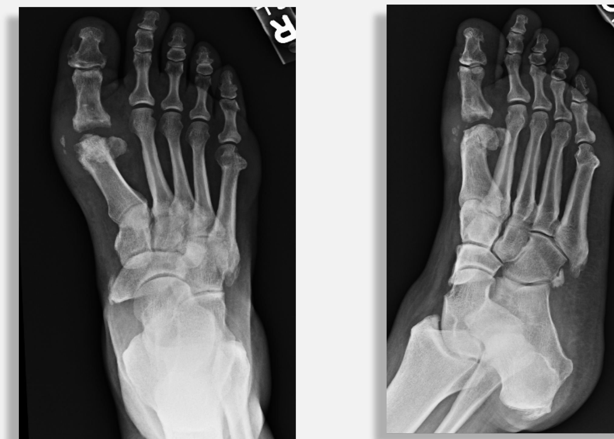
Immediate Post-operative X-rays