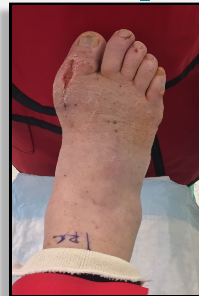
Pre-operative clinical presentation

In an attempt to salvage the 1 st ray, all hardware was removed and a revisional 1 st MPJ arthroplasty was performed. A Silver Impregnated Antimicrobial Dermal Graft was utilized as a spacer. Application of this antimicrobial graft was performed in a purse string fashion.