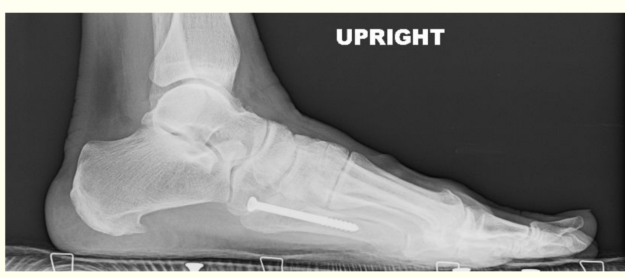
Example of an IM screw violating the joint. Also seen is resultant lucency in the cuboid from the screw head