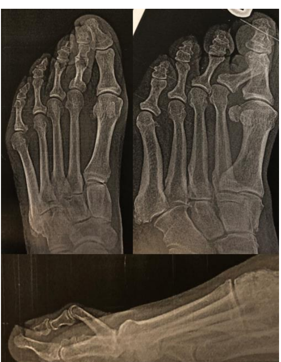
Figure 4. Pre- and postoperative radiographs of patient receiving 2<sup>nd</sup> MTPJ plantar plate repair, with a chevron 1<sup>st</sup> metatarsal osteotomy, and an Akin osteotomy