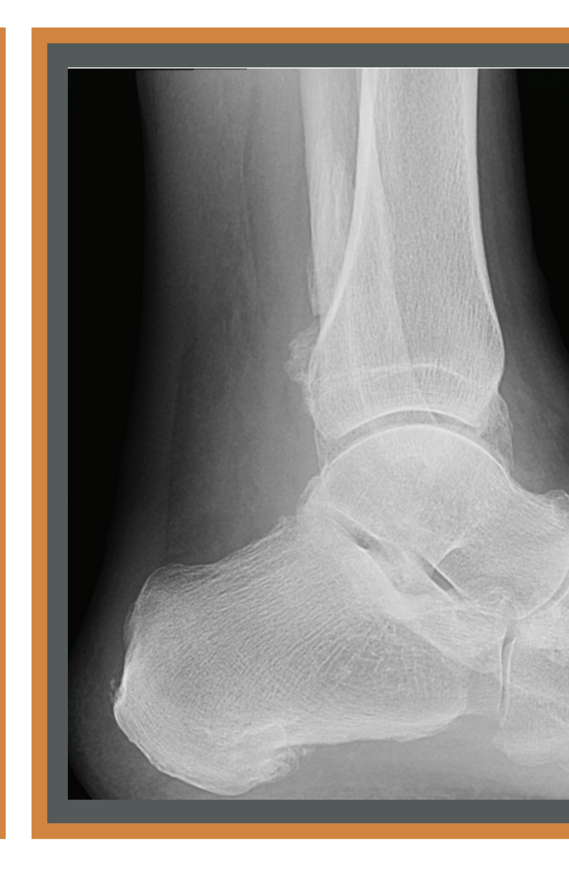
Figure 2 Pre-operative operative

The rearfoot was approached from a prone position with a two-portal technique as described by van Dijk and colleagues<sup>6</sup>. Upon visualization, the FHL tendon was noted to be within a ring of calcific tissue with thickened and scared sheath. The prominent posterior surface of the tibia and talus was resected to normal anatomic contour and the FHL tendon sheath was incised allowing un-tethered movement. Visualized surfaces of the FHL were debrided of fibrotic and calcific tissues. The peroneal and FHL muscles were retracted lateral and medial respectively with Kirschner wires. Tendons