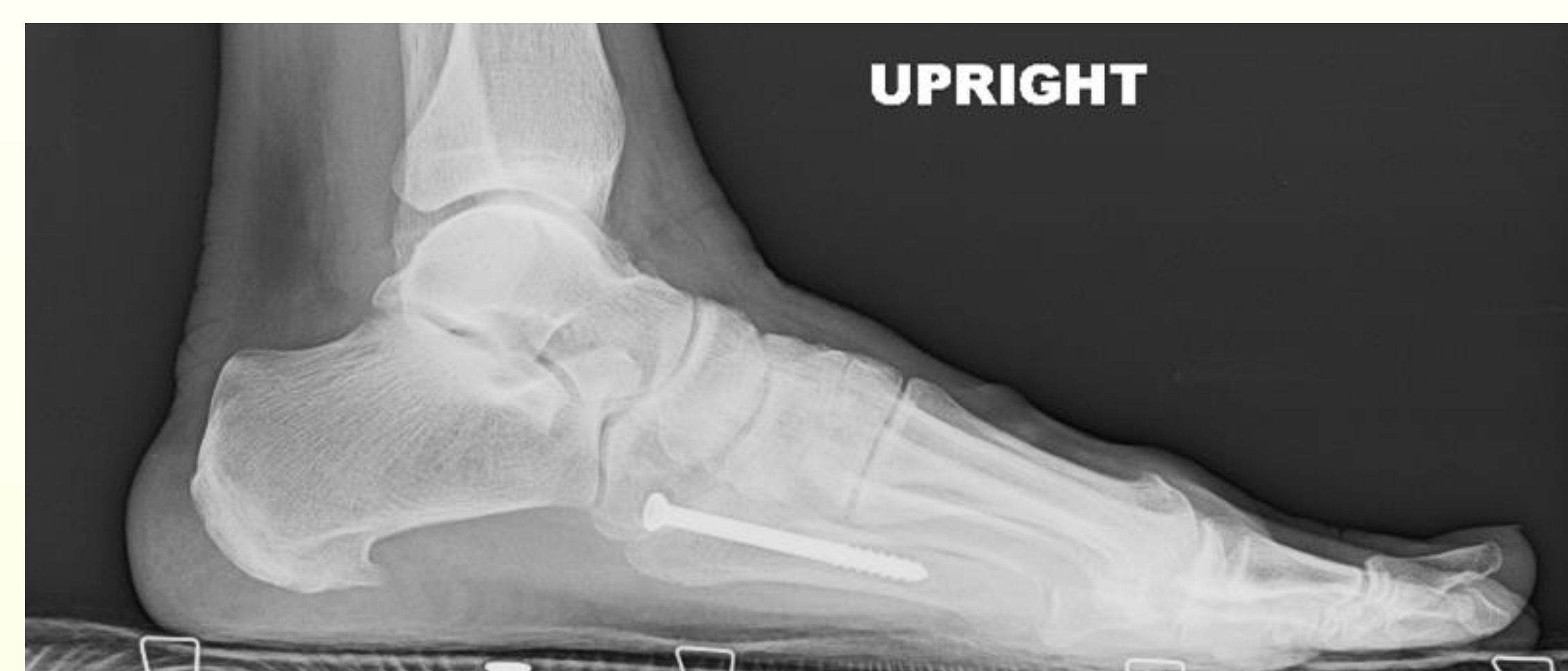
Example of an IM screw violating the joint. Also seen is resultant lucency in the cuboid from the screw head