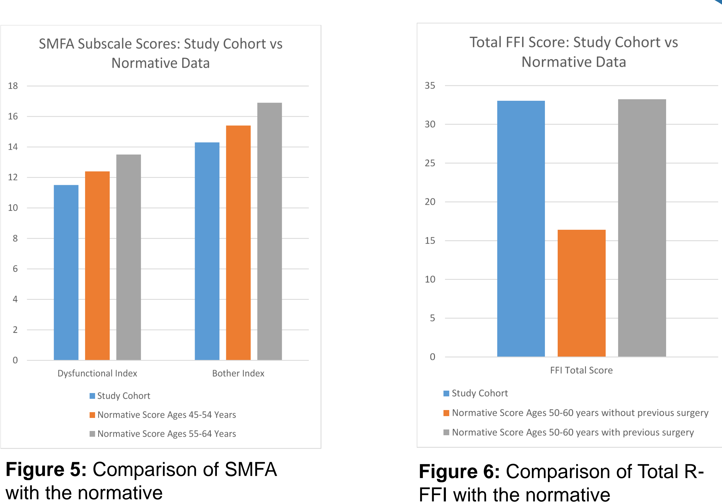
with the normative

There was a total of 9 patients who underwent the procedure. 1 patient deceased at 2