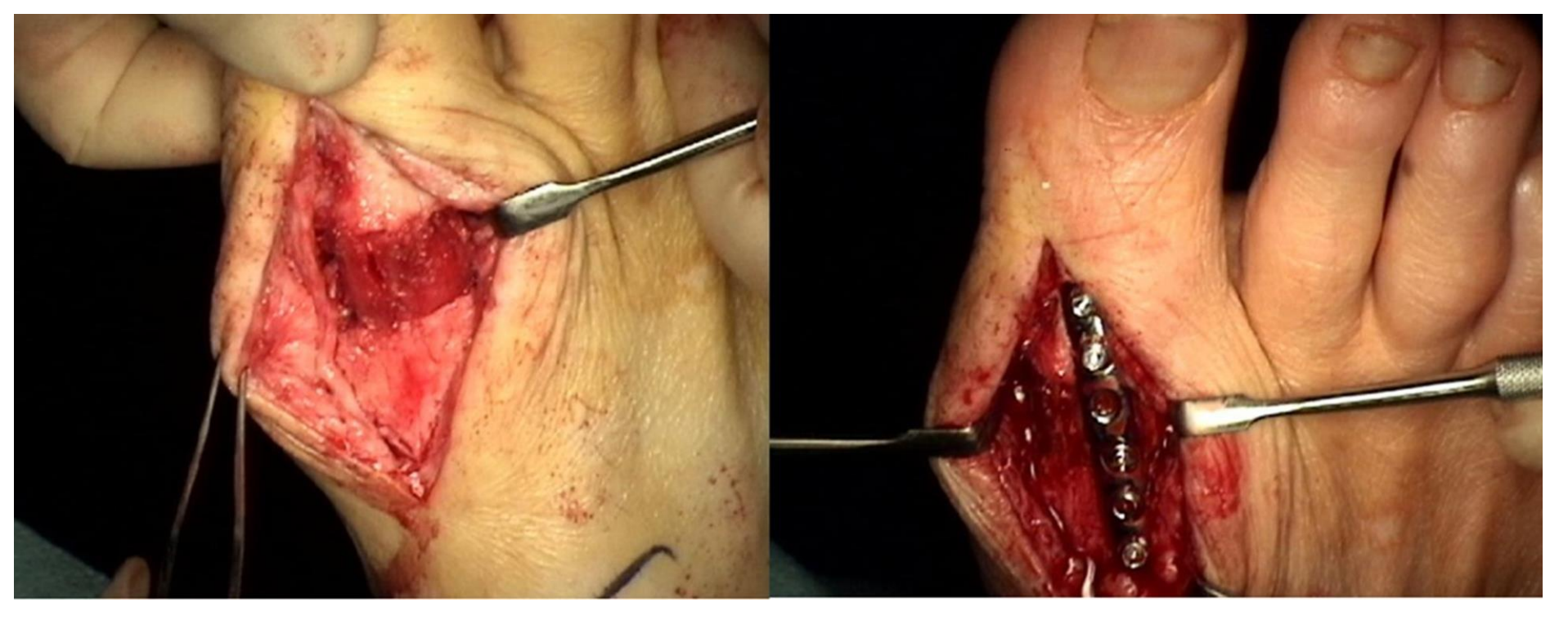
Figure 3: Insertion of the fused autograft in the First MTPJ defect internally fixed with a tubular plate

Figure 2: Preparation of the fused circumferential cortical rim graft using a 2.0 cortical screw in a lag technique