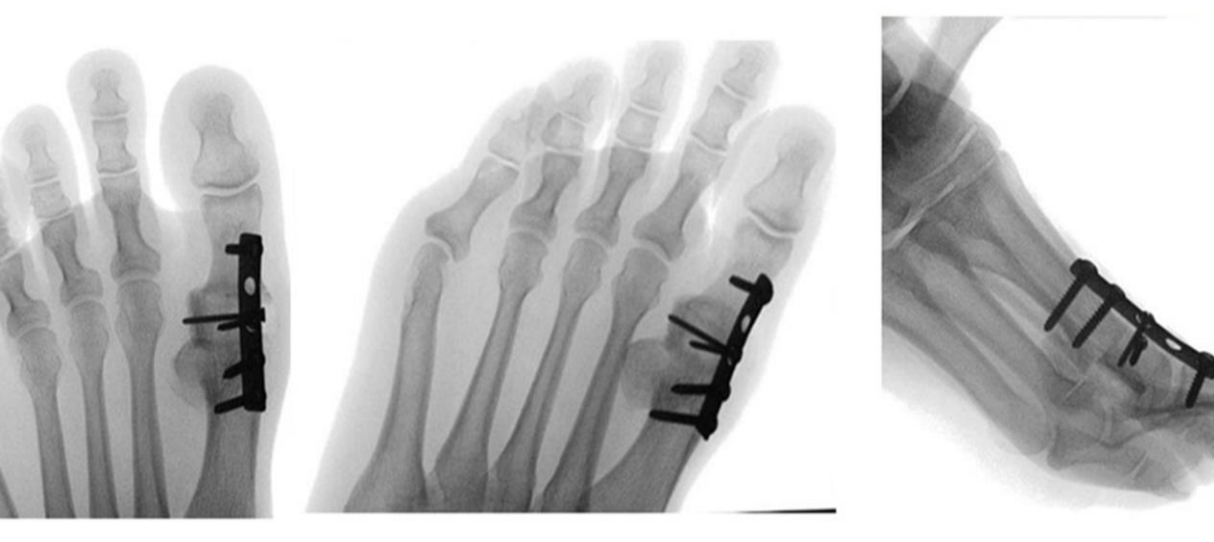
Figure 4: Intra-operative radiographic images after fixing the graft in the defect using a dorsal locking plate

A non-weightbearing protocol for 6 weeks using a short leg cast with a toe plate and knee caddy was initiated. Patients were partial weightbearing from 6 to 9 weeks. At 9 weeks, patients were transferred to a CAM boot with partial weightbearing. Transition to athletic shoe wear was at 12 weeks after radiological union was achieved.