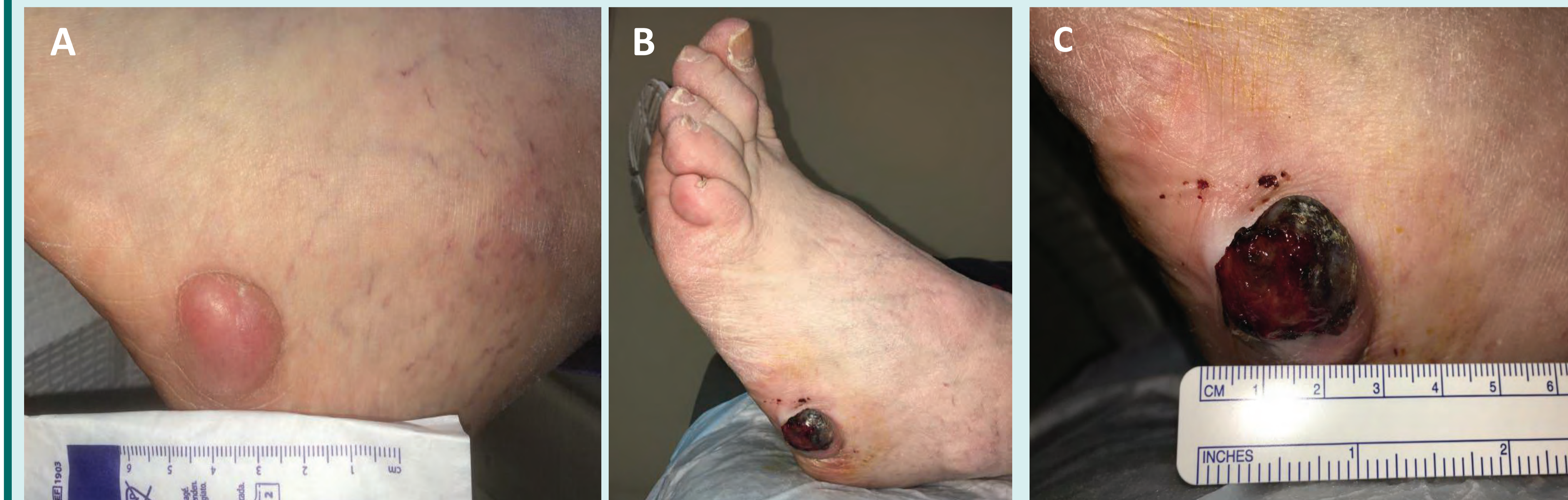
Figure 1. Clinical images documenting the evolution of an angiosarcoma of the left foot. Initial presentation (A), clinical appearance at one year (B,C).

pleomorphic cells forming irregular vascular spaces was appreciated via CD31 immunostaining and hematoxylin-eosin (H&E) staining (Figure 2). The patient was promptly referred to the General Surgery Department for further management with the recommendations to obtain the following: an MRI of his foot for primary tumor analysis; a chest and abdomen/pelvis CT; and a head MRI to determine extent of metastasis. The patient declined radiation and chemotherapy treatments, desiring only local surgical excision of the mass with skin graft or flap closure. Due to the patient's comorbidities and declining health, he died prior to advanced imaging and surgical intervention.