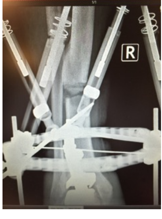
Figure 5: Increase in length to offset LLD