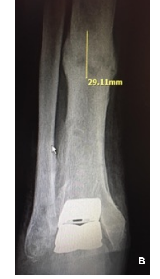
Figure 8: (A) Lateral and (B) AP views showing healed osteotomy site correcting for the deformity and intact ankle implant

Surgical intervention for ankle replacement is vastly growing in popularity, but becomes increasing difficult when a proximal leg deformity is present. Lower limb deformity correction has advanced significantly with the use of computer guided software. This allows for meticulous calculation to perform gradual correction. Ankle joint replacement has improved with the use of CT guided cutting blocks, which increase the precision of the surgery and increase the predictability of outcomes.