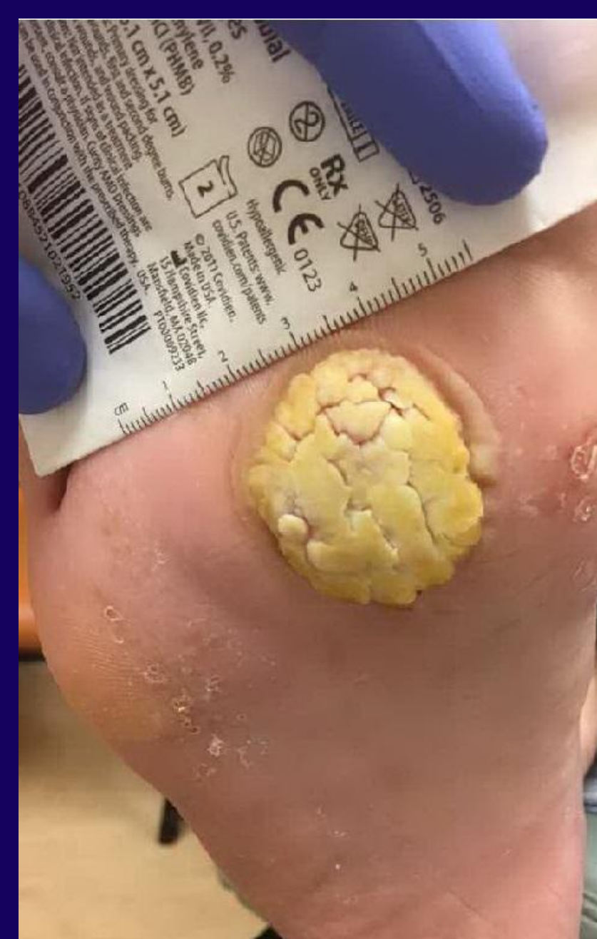
Figure 4 Immediate post-operative image