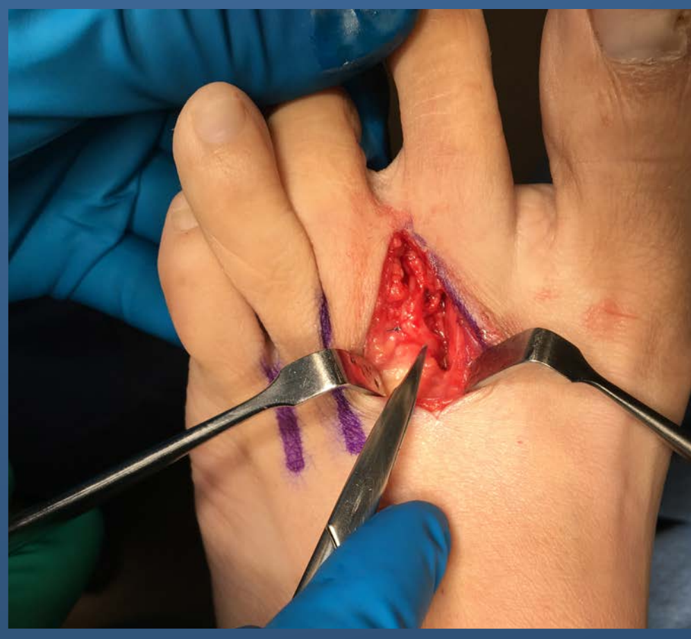
Fig 2. Translating plantar digital nerve dorsally with prolene suture.