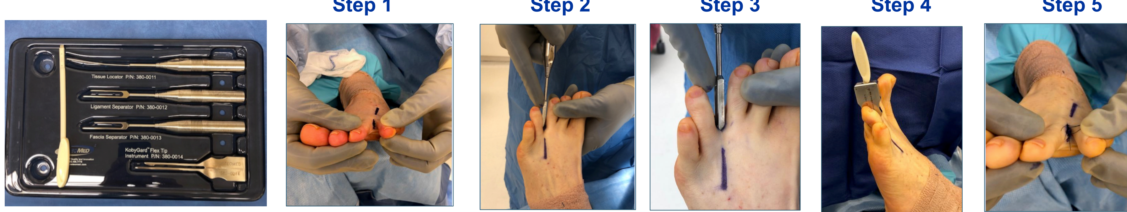
Figure: Surgical Steps for Minimally Invasive inter-metatarsal Nerve Decompression Step 2 Step 3 Step 4 Step 1 Step 5