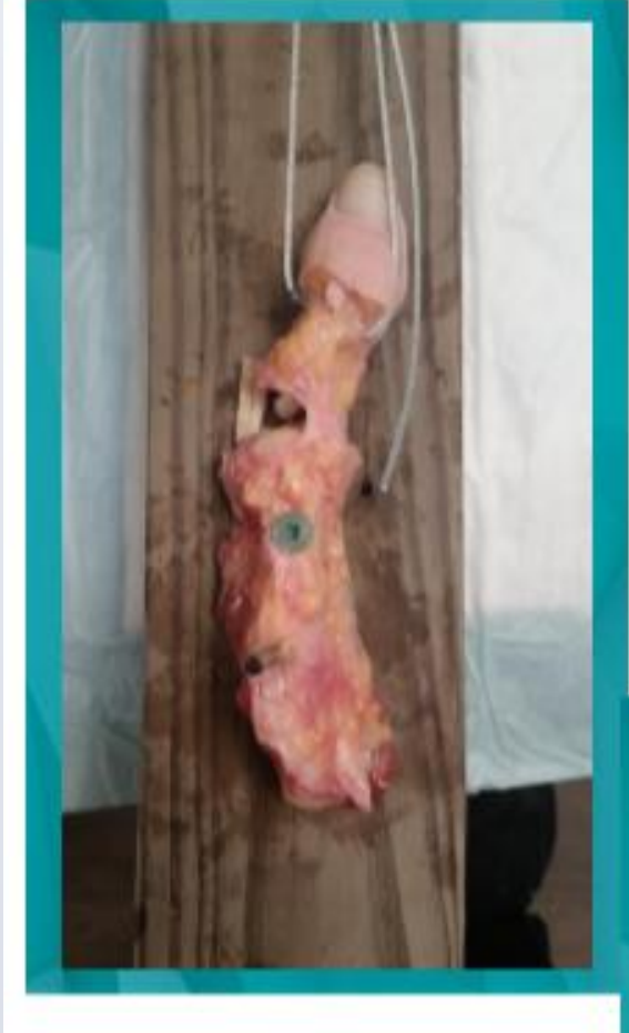
Figure 1: The first ray removed from the cadaveric specimen, anchored into place, with unnecessary soft tissue attachments dissected away