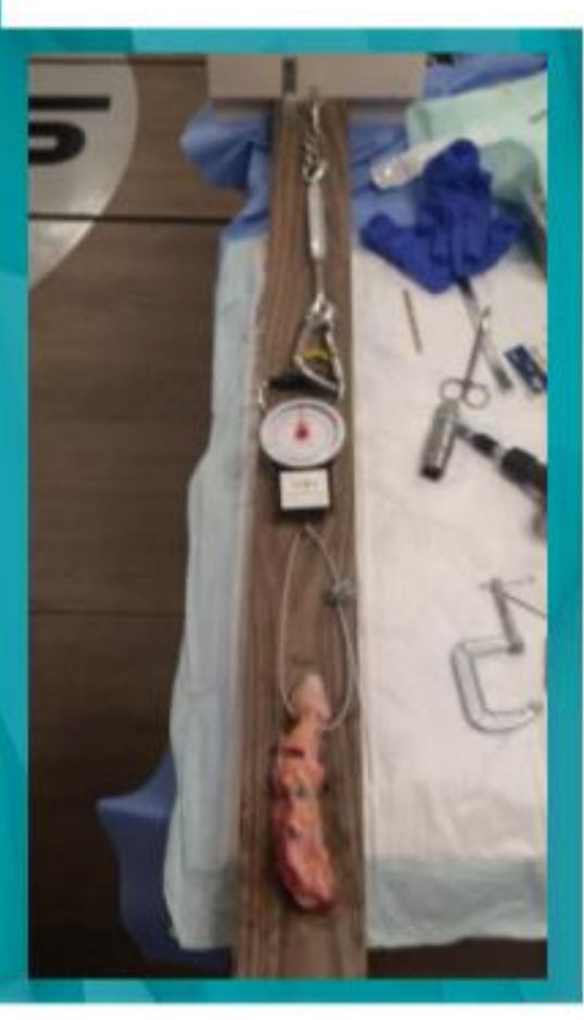
Figure 2: The custom testing jig in full

he first ray was anchored in place with rews through the metatarsal to the urface used as the base. A hole was d through the head of the proxima inx in a medial to lateral direction and attached to a carabiner. The carabiner was fastened to the lever of a mechanical force gauge.