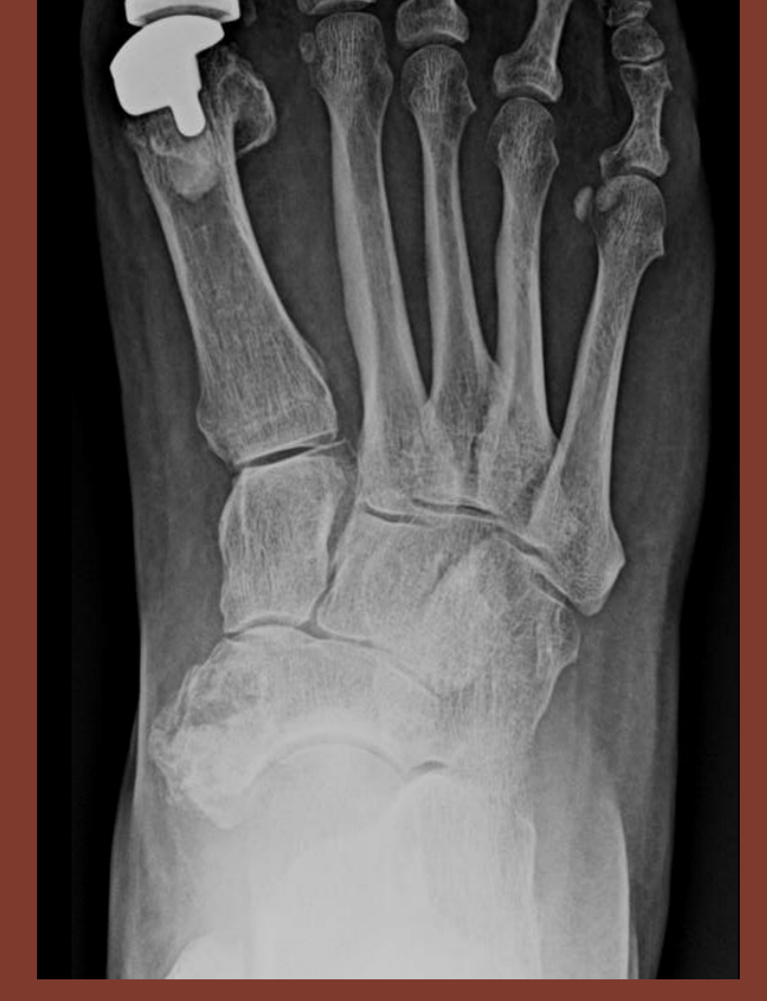
Figure 4. Post-operative anterior-posterior weightbearing radiographs of the right foot