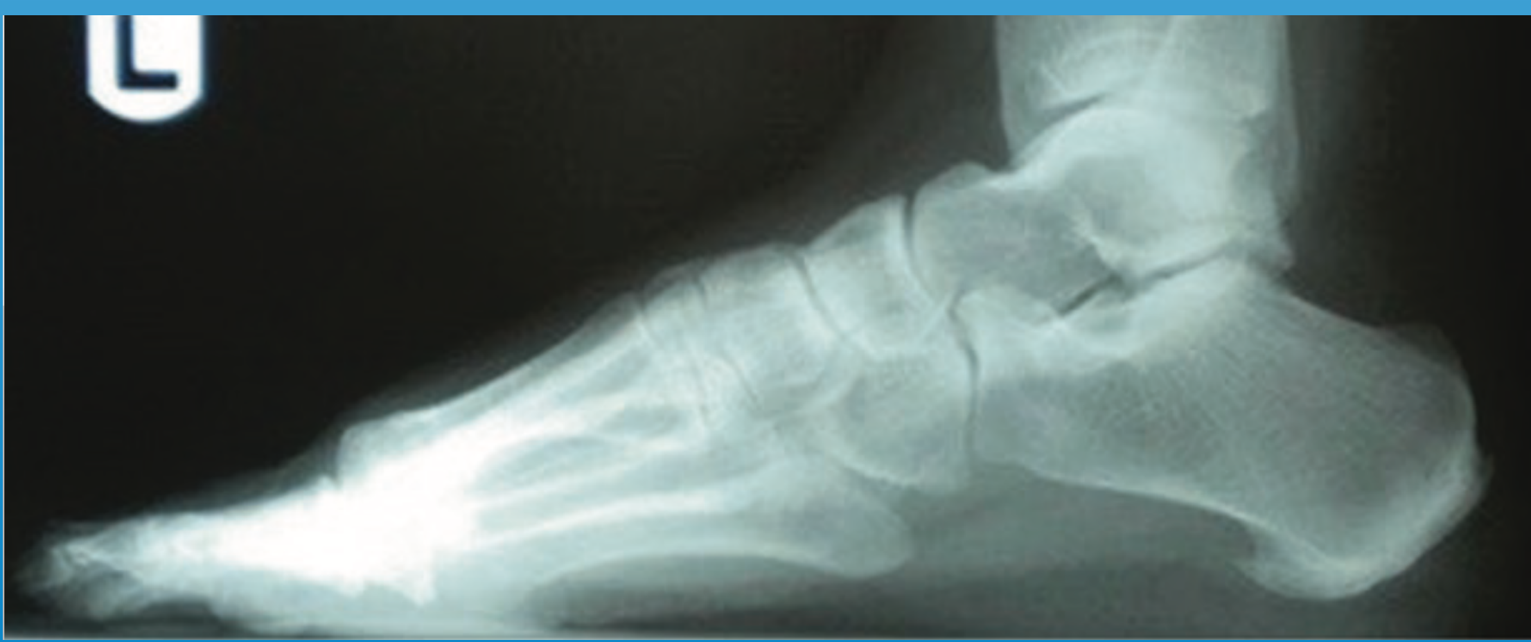
Fig. 5- Lateral radiograph of patient with HAV deformity. Note the elevatus of the first ray indicative of first ray insufficency.

Fig. 3 - Demonstration of increased weight bearing pressure to the second metatarsal head in head indicating first ray insufficiency.