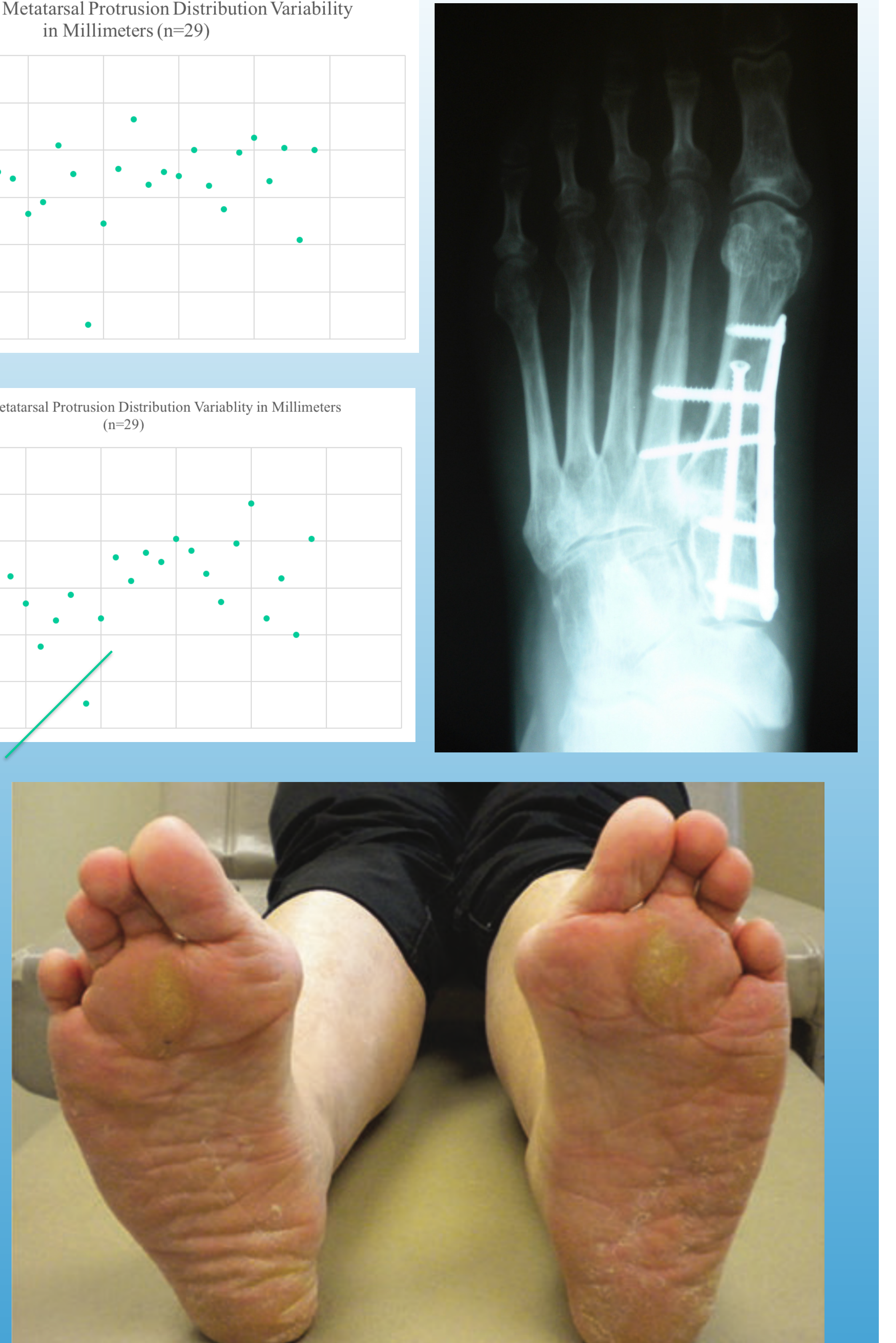
Fig. 3 - Demonstration of increased weight bearing pressure to the second metatarsal head in head indicating first ray insufficiency.