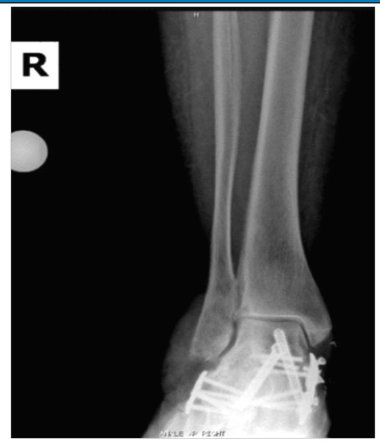
Figure 2: Pre-op radiograph

Step 4: A 2-hole plate was placed over the posterior lateral surface of the distal fibula which was provisionally fixated with an olive wire through the distal hole. The proximal hole was then prepared and drilled in anticipation of insertion of the tran-syndesmotic screw (Figure 4). One fully threaded 3.5mm x 55mm screw was advanced through the plate and placed in a trans-syndesmotic fashion, parallel with the ankle joint (Figure 5). The olive wire was removed from distal hole of the plate and at this time the fibula was prepared and drilled with a 4.0mm x 18mm screw (Figure 6). The construct was stressed under fluoroscopic guidance and no diastasis of the syndesmosis was appreciated.