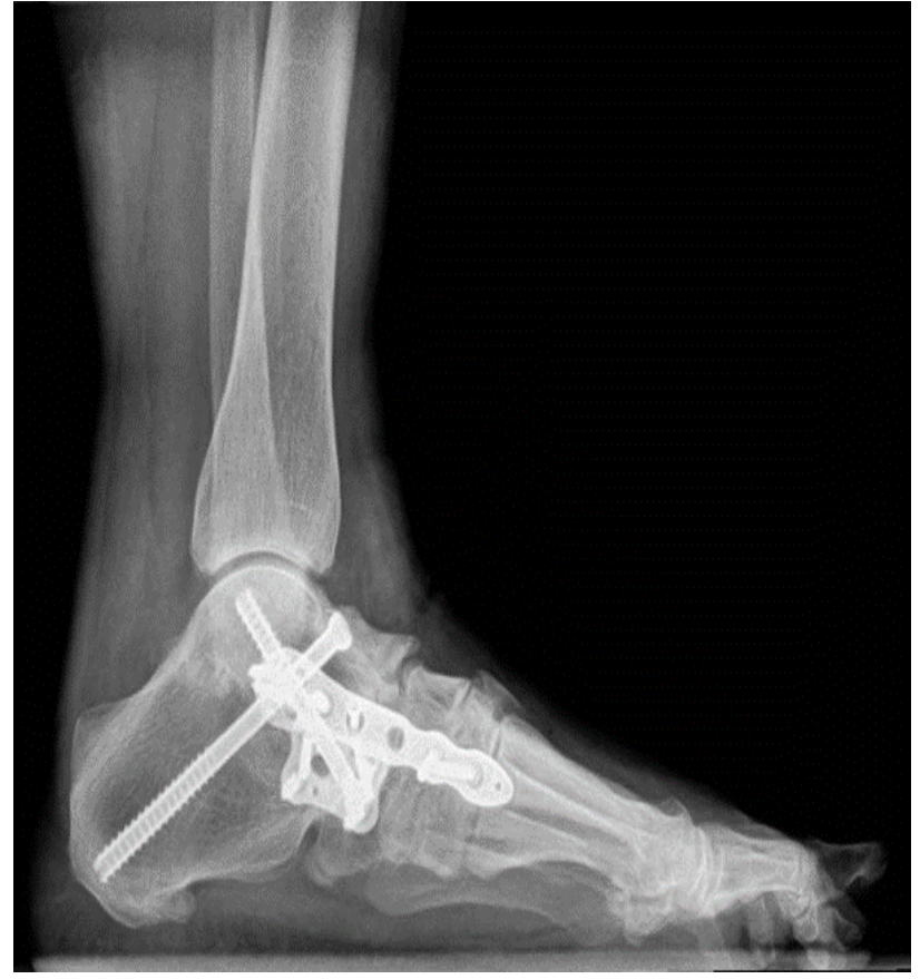
Figure 1: Pre-op radiograph

A 74-year-old female presents to the office status post triple arthrodesis in 2013, she proceeded with an uneventful postoperative course. Patient presents with pain localized to the right ankle since January 2018. Physical exam revealed pain to the right lateral ankle with end range of motion in dorsiflexion and plantarflexion. There was pain with palpation to the distal tibiofibular joint on the right. Radiographic imaging showed arthrosis to the tibiofibular joint and extensive osteophytic changes surrounding the joint (Figures 1 & 2). It was then determined that surgical intervention consisting of ankle arthroscopy and arthrodesis of the arthritic tibiofibular joint was to be performed.