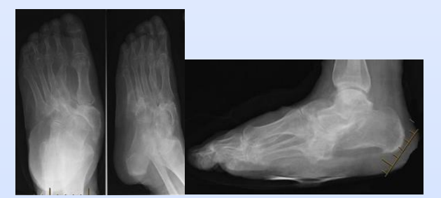
Figure 1. Representative preoperative radiographs of a patient with Eichenholtz Stage 3 midfoot Charcot neuropathic osteoarthropathy. The navicular and cuneiforms have consolidated to become one continuous bone. Note the chronic stress fracture at the second metatarsal from the first ray insufficiency due to the talonavicular joint