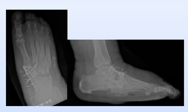
Figure 7. Radiographs of the patient in Figure 6. after subsequent nonunion repair and applicatio of the dorsomedial column plate to prevent any compression of the dorsal talonavicular arthrode: