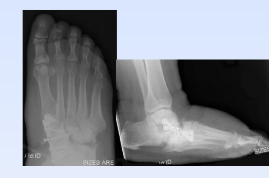
Figure 6. Radiographs showing the radiolucency and nonunion of the talonavicular joint 9 months after the initial reconstruction.